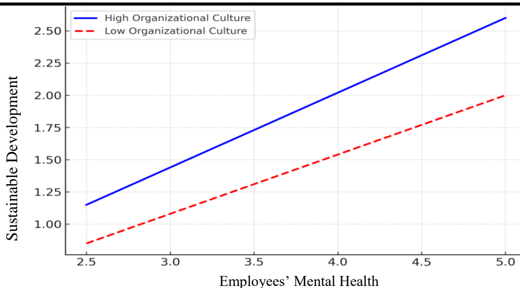
Figure (2): Moderating Effect of Organisational Culture